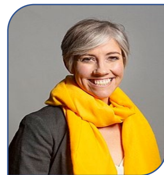
Keynote speaker for final conference: Daisy Cooper MP